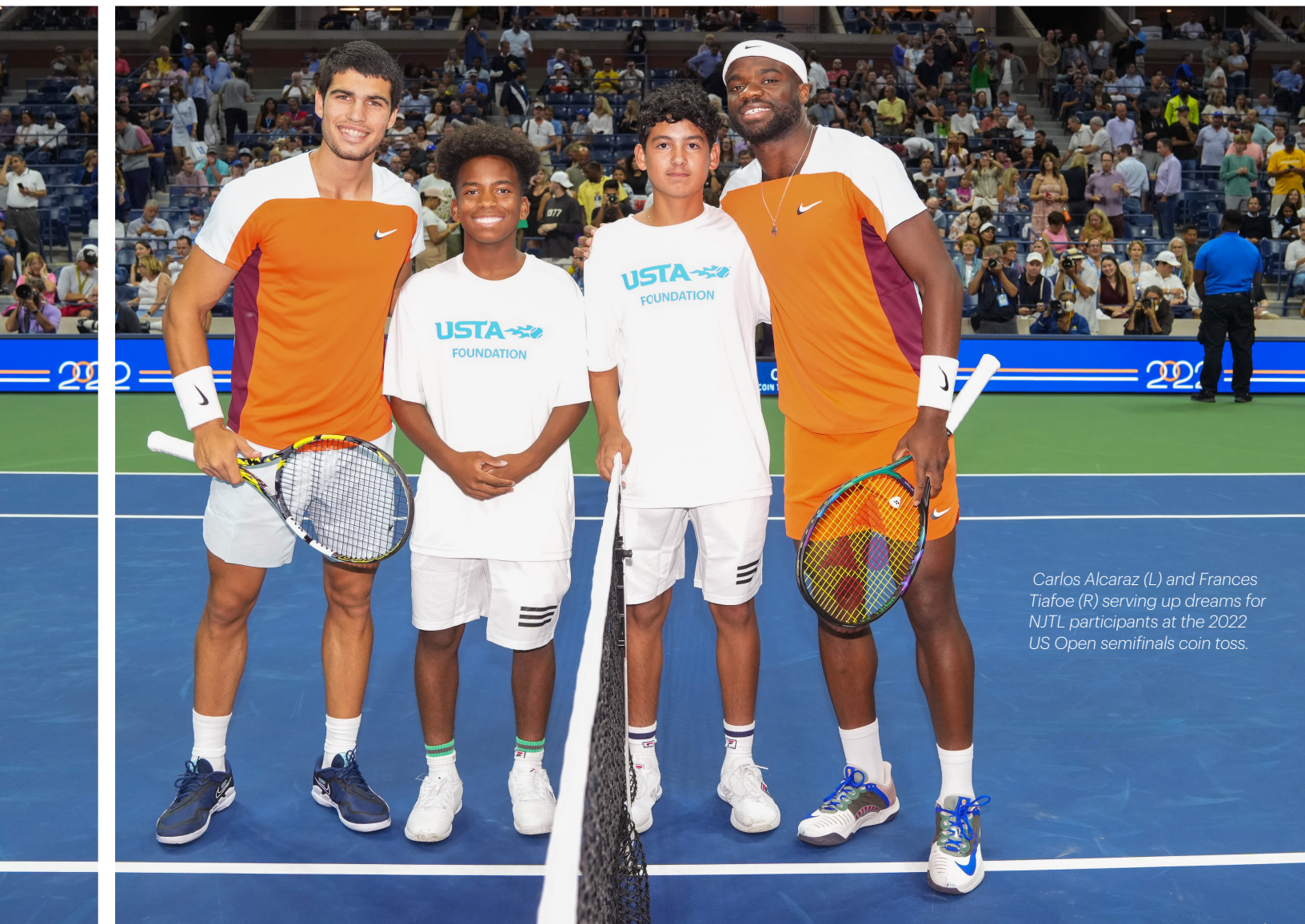
Carlos Alcaraz (L) and Frances Tiafoe (R) serving up dreams for NJTL participants at the 2022 US Open semifinals coin toss.